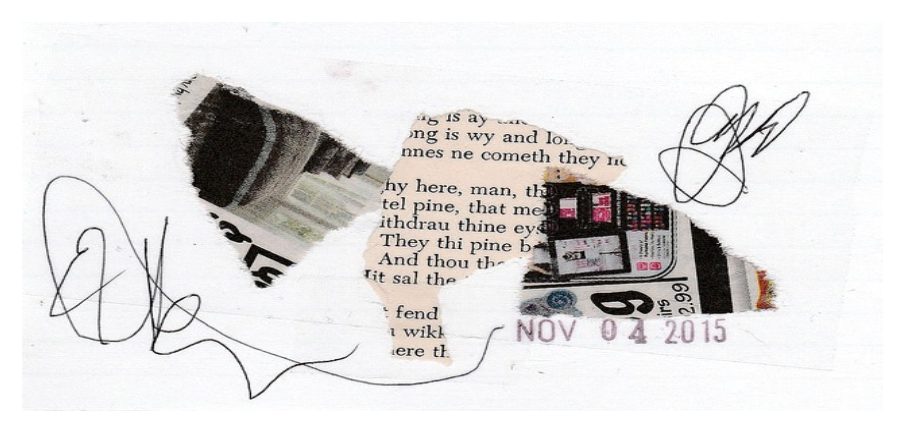
here, pine thine pine, 2015, jim leftwich