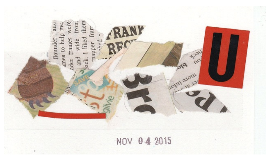
vispo with grab bag stickers from JF -018

a severed tyger paw from Byzantium on a faded Turkish rug above a thick red line