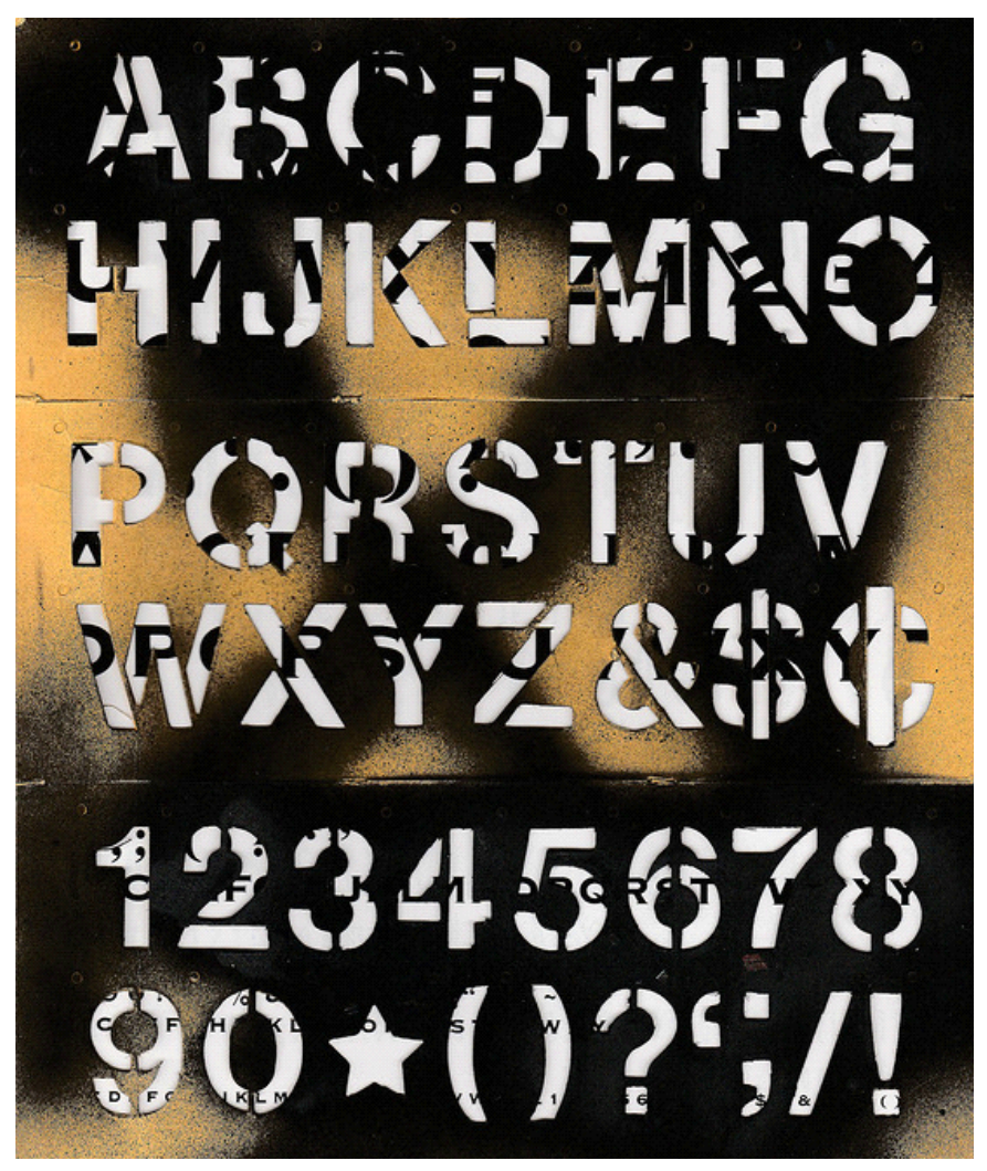
spontaneous overflow of lettrist poetics 018, Sept. 2015, jim leftwich

It looks like a fading yellow cinderblock wall, with a huge X spray-painted on its surface, with a sheet of letters, numbers and symbols projected onto the painted surface, but even the spiderweb to the left of the W is an optical illusion. The whole thing is an optical illusion. Most of the yellow stencil sheet has been spray-painted black. The typeface sheet beneath the stencil has black lettering on white paper. It looks like writing, or at least it looks like the building blocks and primary units of writing, but we can't quite read it, we aren't quite certain what it is, so we don't quite know what to do with it.